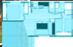
Mobil-Home Plan 4 places/2 bedrooms ± 32 m 2 renovated in 2022