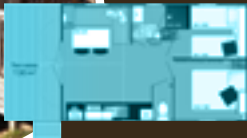
Mobile Home Plan Loggia 4 places/2 bedrooms ± 32 m 2 - 2020