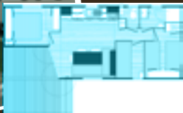
Mobil-Home Plan 5 places/3 bedrooms ± 37 m 2 2013 to 2016