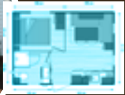
Mobil-Home Plan 2 places/1 bedroom ± 20 m 2 renovated in 2016