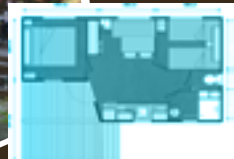
Mobil-Home Plan 4 places/2 bedrooms ± 28 m 2 renovated in 2022